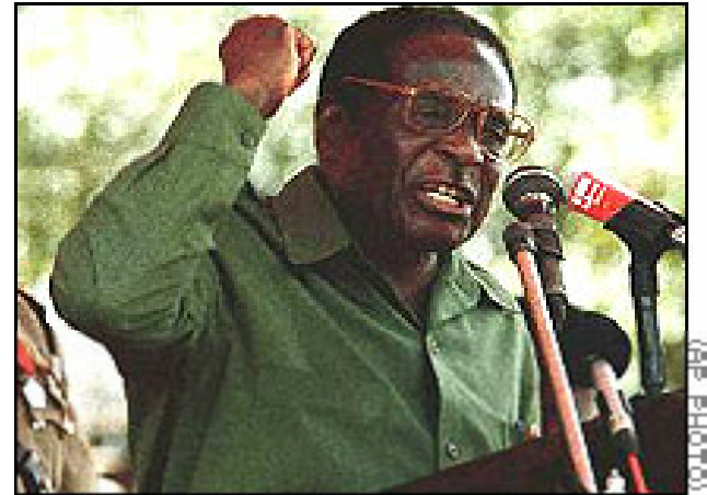
President Robert Mugabe