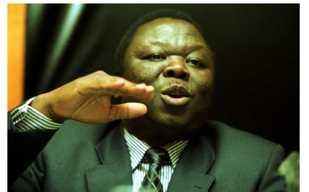
Morgan Tsvangirai, Opposition Leader